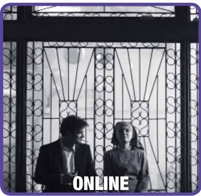
Ida (dir. Paweł Pawlikowski) streaming on JFI On Demand

JFI Next Wave programs champion alternative Jewish media focusing on art. social justice, identity and other themes for the next generation of Jewish film lovers and supporters, presented yearround and at SFJFF.