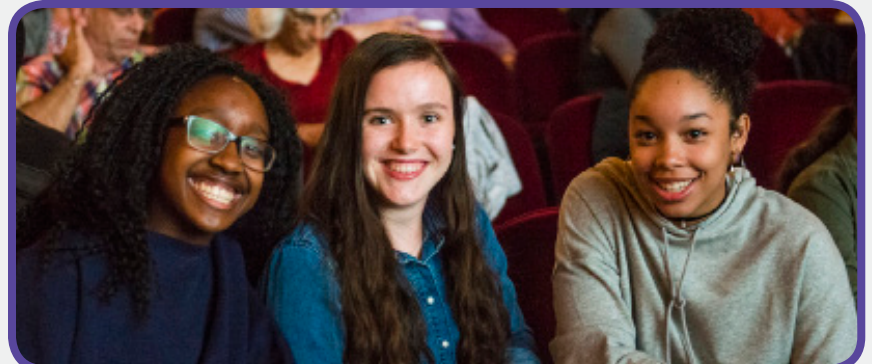
A Next Wave screening at the 37th San Francisco Jewish Film Festival

JFI's audience and membership-based community are loyal, passionate and highly educated, frequently reporting an average income of $100,000-$199,000. They are film and Jewish culture enthusiasts highly engaged with JFI's year-round programming by accessing both live event and online cinematic experiences.